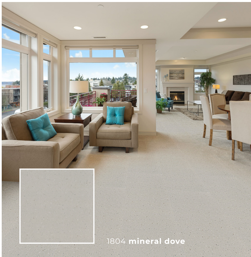
1804 mineral dove

Dimensions 457mm x 457mm Overall Gauge 3mm Wear Layer 0.15mm Packaging 16 pcs per box