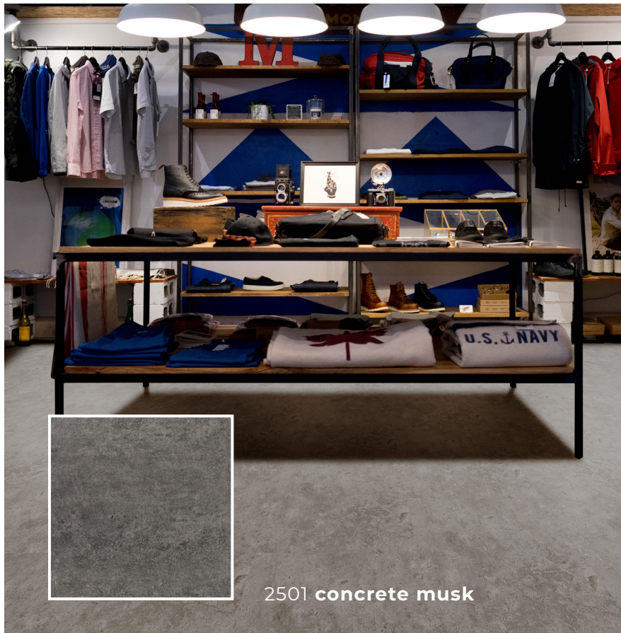
2501 concrete musk