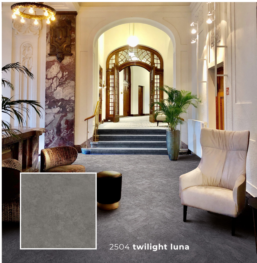
2504 twilight luna