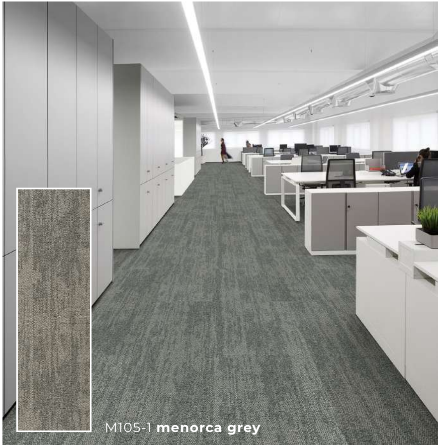
M105-1 menorca grey