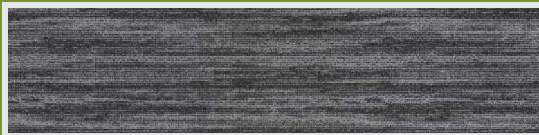
M9012-1 TANGLE GREY