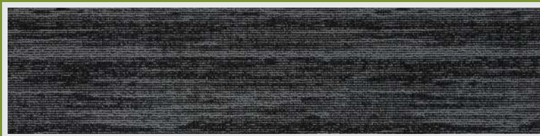
M9012-2 TANGLE CARBON