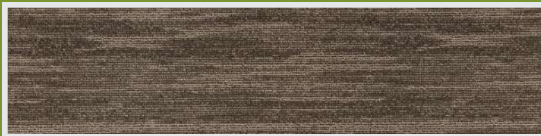
M9012-3 TANGLE BROWN