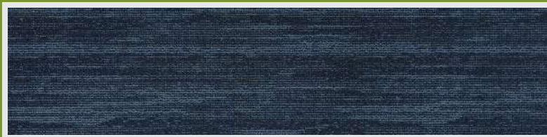
M9012-4 TANGLE NAVY