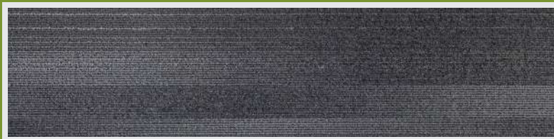
M9013-1 BLOCK GREY