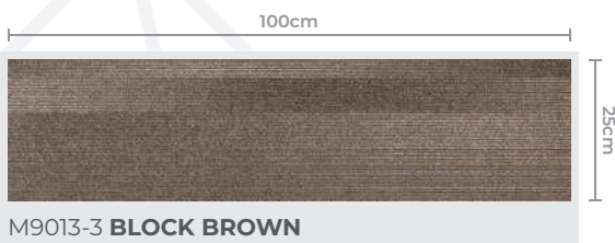
M9013-3 BLOCK BROWN