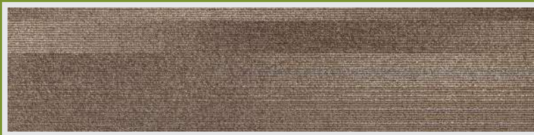
M9013-3 BLOCK BROWN